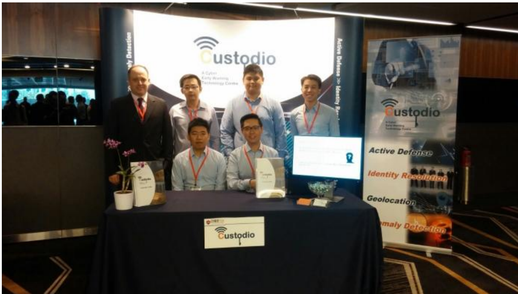
Custodio's booth at Cybertech Singapore 2015

Secura Group, one of the leading providers of security products, services, and solutions in Singapore, has entered into a subscription and shareholders' agreement with Custodio Technologies (CPTL) to subscribe for 200 new ordinary shares in CPTL for a cash consideration of US$4.5 million.